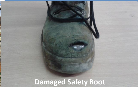
Damaged Safety Boot